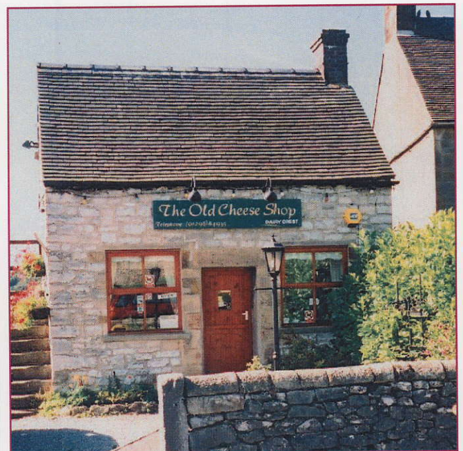
The Old Cheese Shop, Hartington

At the signpost to Hartington, turn left through a gate and across a field, then over the river by a footbridge. The path crosses fields, aiming for the woods to the left of the dairy buildings and enters them via a stile. Go into the forecourt of the dairy and turn left along the lane back into the centre of Hartington.